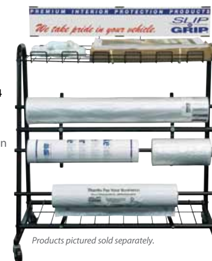
Products pictured sold separately.